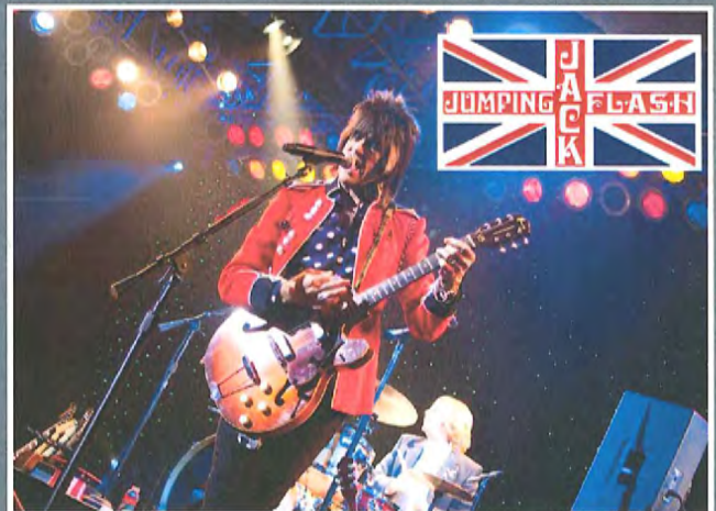
Summer Concert Series