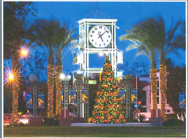
Tree Lighting Celebration