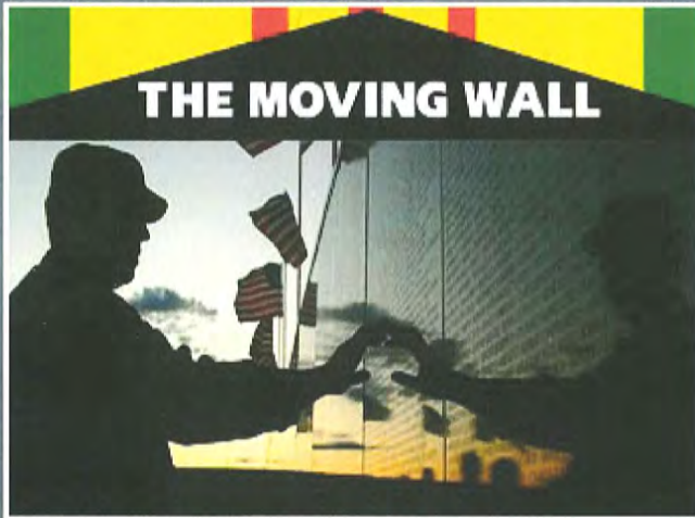
The Moving Wall