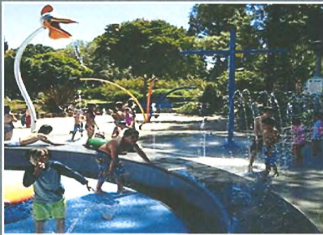
Atlantis Play Center - Splash Pad