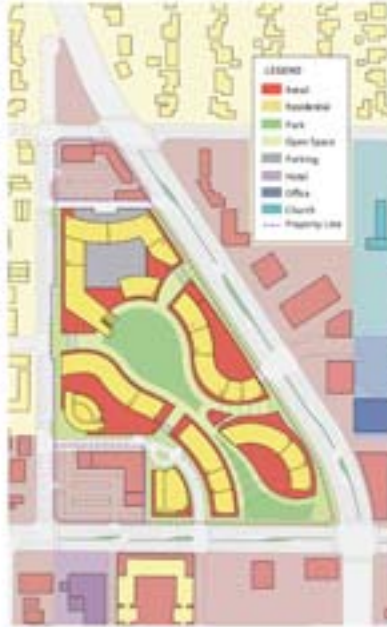
LAND USE DIAGRAM