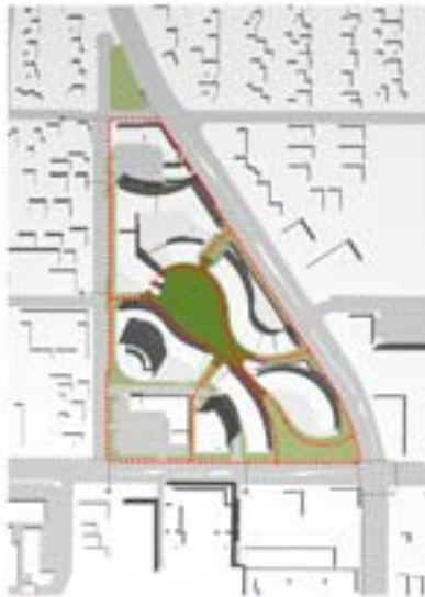
OPEN SPACE / URBAN TRAIL DIAGRAM