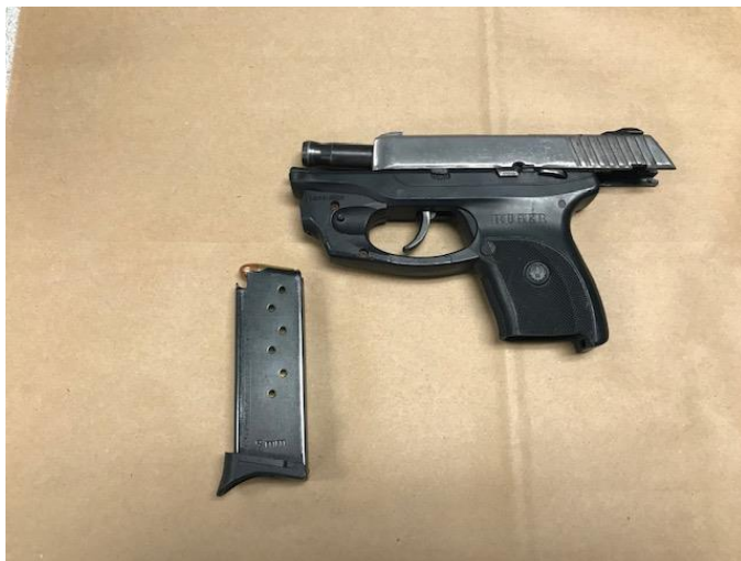
Stolen 9mm handgun