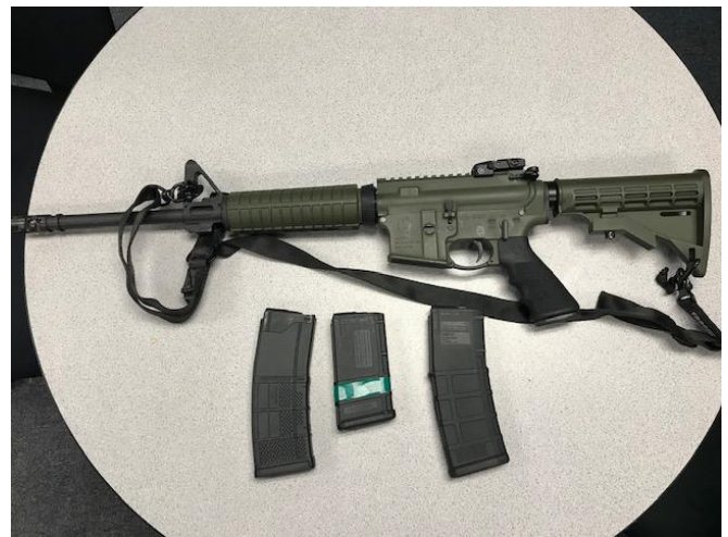
AR-15 style rifle (.223)

Carl Whitney, Lieutenant Professional Standards Division / PIO 📧 O: 714.741.5786 W/C: 714.741.5871 24 Hour: 714.741.5704